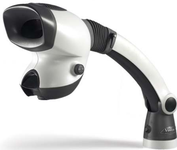
Eyepieceless optics increase operator head freedom, reducing fatigue

Mantis Compact utilises Vision Engineering's patented Expanded-Pupil technology to provide up to 10 times greater freedom of head movement than conventional binocular eyepiece microscopes.