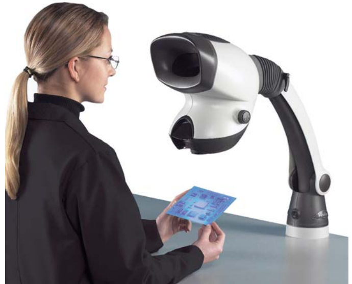
Mantis Compact UV with swing away boom mount for added flexibility

Mantis Compact UV is a variant of Vision Engineering's Mantis Compact stereo microscope, offering clear, magnified imaging of UV fluoresced cracks, flaws and coatings. Fault detection is made more effective by magnification highlighting minute cracks and pitting.